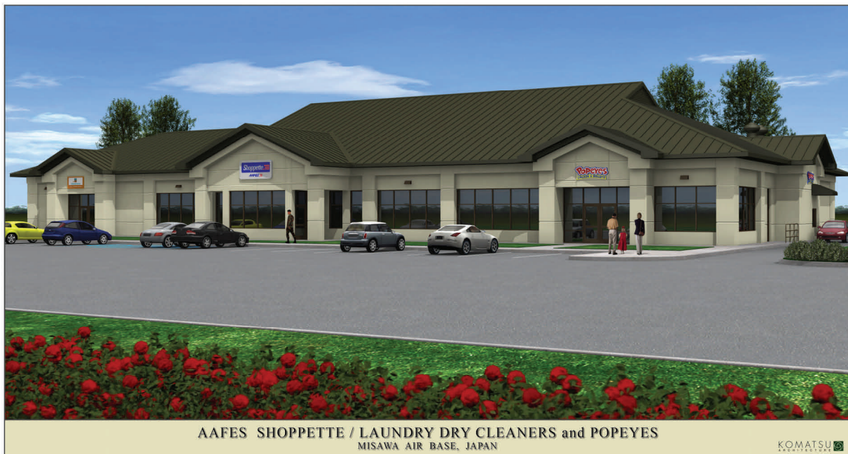
AAFES SHOPPETTE / LAUNDRY DRY CLEANERS and POPEYES MISAWA AIR BASE, JAPAN